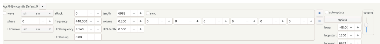
The frequency modulator synced synth screenshot

Produce audio data using its oscillators. The count of oscillators can be adjusted by clicking add/remove. You have on the right the option to auto-update changes you do with the controls or do it manually by the update button. Loop start and loop end allows you to specify what region of the audio data shall be looped in order to get the desired note length.