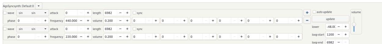
The synced synth screenshot

Produce audio data using its oscillators. The count of oscillators can be adjusted by clicking add/remove. You have on the right the option to auto-update changes you do with the controls or do it manually by the update button. Loop start and loop end allows you to specify what region of the audio data shall be looped in order to get the desired note length.