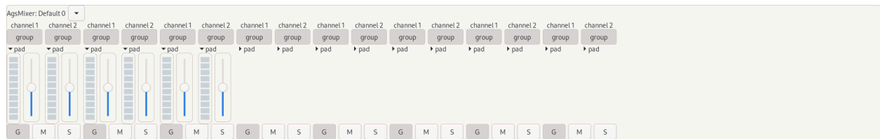
The mixer screenshot

Bundle audio lines with the mixer and perform toplevel stream manipulation. It contains per audio channel a volume indicator and may contain LADSPA or Lv2 plugins.