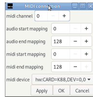
The MIDI dialog screenshot

The MIDI dialog allows you to select the MIDI sequencer to assign of the current machine. The MIDI channel is the MIDI channel assigned to the MIDI device, useful with multiple devices. Upto 16 devices are allowed. You might want to perform start and end key. Further you can adjust the start and end channel.