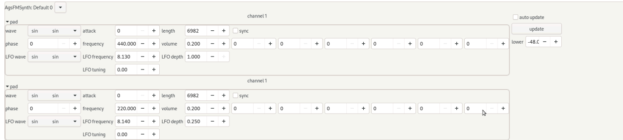
The frequency modulation synth screenshot

Produce audio data using its oscillators. The count of oscillators depends on number of input lines. They are adjusted vertically. You have on the right the option to auto-update changes you do with the controls or do it manually by the update button.