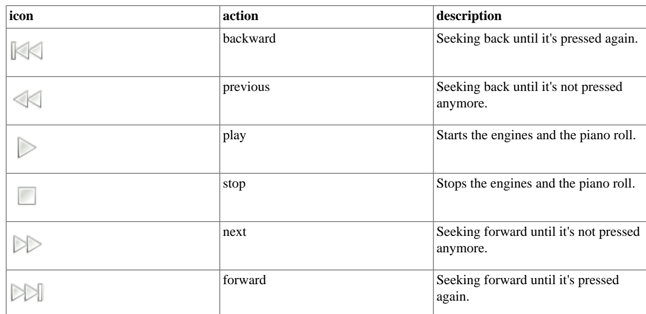
Table 4.1. AGS playback controls table

The loop checkbox enables the loop L and loop R settings below. It causes the notation to loop playback. Auto-Scroll checkbox animates the horizontal scrollbars to follow playback position. Use exclude sequencers checkbox to enable/disable pattern based sequencers.